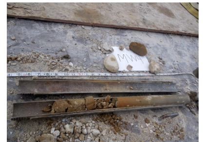
Fig. 2—Soil sample collected during drilling

The data collected in the Phase Two ESA was used by the client to make an informed decision to purchase the property.